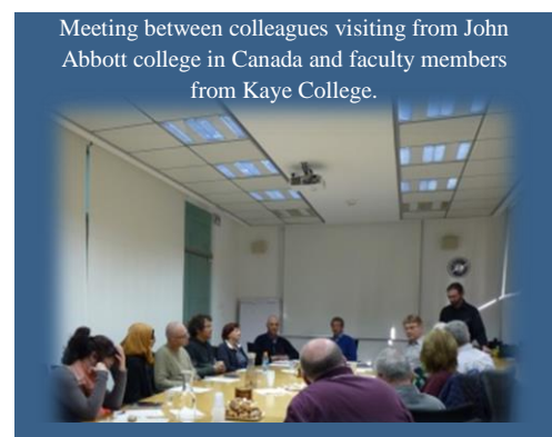
Meeting between colleagues visiting from John Abbott college in Canada and faculty members from Kaye College.

We are currently discussing various options for international collaboration.